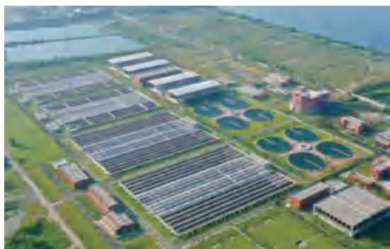
● 中国中铁建设的国内一次性建成规模最大的污水处理厂——武汉北湖污水处理厂项目 Wuhan Beihu Wastewater Treatment Plant – the largest domestic sewage treatment plant built by CREC at one time

在生物多样性保护方面，公司持续监测生物多样性影响，并采取有效措施，努力降低施工生产对生物种群造成的影响。