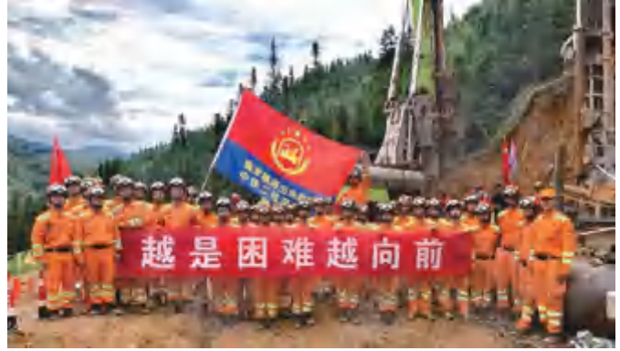
中国中铁三支国家隧道应急救援队积极参与全国救援 Three national tunnel emergency rescue teams of CREC provided rescue nationwide