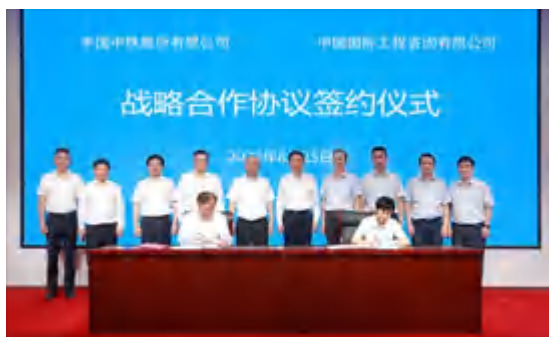
中国中铁与中咨公司签署战略合作协议 CREC signed a strategic cooperation agreement with CIECC

2022年，公司充分利用在资金、技术、管理及人才等方面的优势，与新疆维吾尔自治区、辽宁省、山西省、山东省、安徽省、江苏省、福建省、重庆市、云南省、贵州省、中国信保、国药集团、中国建研院、中信集团、中国人保、国家电投、中国联通、中国能建、中咨公司等地方政府、企业进行了高层交流，为之后的深入合作奠定了良好基础。