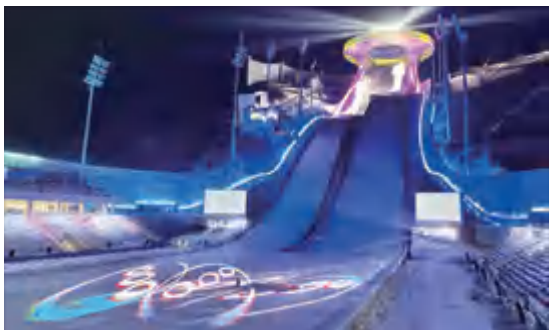
中国首个跳台滑雪场地——国家跳台滑雪中心“雪如意” “Snow Ruyi” at the ski jumping center – China’s first ski jumping venue

In 2022, the Company won 19 China Construction Engineering Luban Prizes and 54 National Quality Engineering Awards, including 4 Gold Awards.