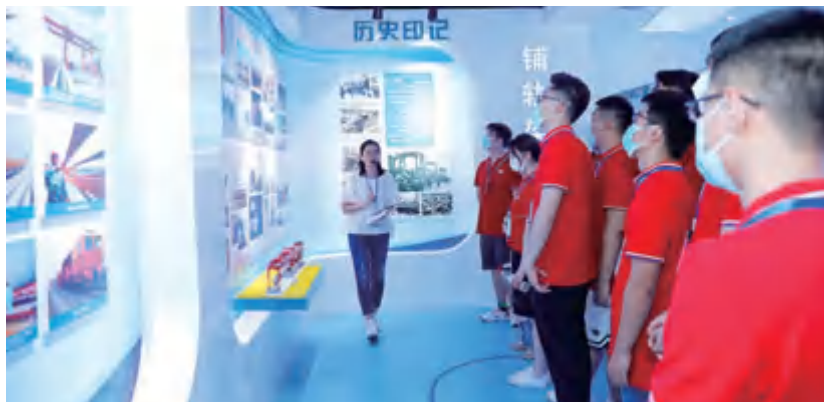
中国中铁一局新运公司组织新员工学习企业历史 China Railway First Group Track Engineering Co., Ltd. organized new employees to learn corporate history

In 2022, the Company trained more than 810,000 personnel, accounting for 90% of the total number of employees. Among them, 225,800 were male, accounting for 91%, and 44,200 were female, accounting for 90%; 640 were senior management personnel, accounting for 100%; 9,977 were middle management personnel, accounting for 100%. The employees received an average of 80 hours of training, for male and female both. Senior management personnel received an average of 106 hours of training, while middle management personnel received an average of 98 hours.