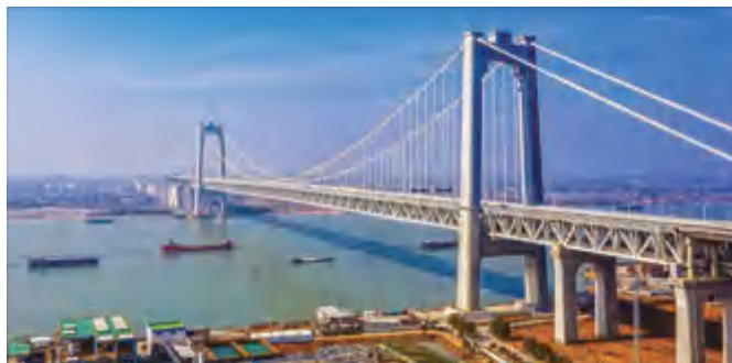
世界首座高速铁路悬索桥——五峰山长江大桥 Wufengshan Bridge – the world’s first high-speed suspension bridge