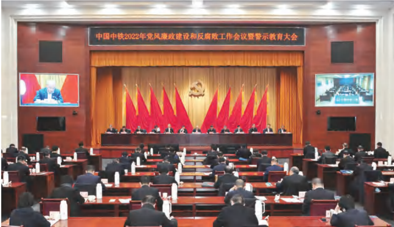
中国中铁召开2022年党风廉政建设和反腐败工作会议暨警示教育大会 CREC held the 2022 meeting on improving Party conduct, anti-corruption and warning education

公司严格遵守《中华人民共和国刑法》《中华人民共和国反不正当竞争法》《中华人民共和国反洗钱法》《中央纪委关于严格禁止利用职务上的便利谋取不正当利益的若干规定》《中国共产党领导干部廉洁从政若干准则》和《中国共产党廉洁自律准则》等中国及海外业务所在国家或地区的法律法规，坚决禁止贿赂、勒索、欺诈及洗黑钱等行为。公司制定有《纪检组织处理信访举报和案件监督管理工作实施办法》，坚决做到依规依纪依法处理信访举报和开展案件监督管理工作。公司从总部到所属各级企业都设有纪检组织，负责反腐败方面的信访举报工作。各级纪检组织设有信访举报问题线索处置台账，对每一条问题线索都严格按照相关规定进行处理。严格坚持信访举报处置审批程序，要求相关工作人员严格遵守保密制度，坚决保护举报人隐私和安全，对于隐瞒问题线索或失密泄密的，将追究相关人员责任。