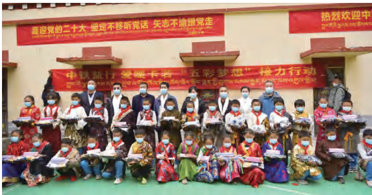
中国中铁与中国志愿服务基金会携手，在昌都市卡若区约巴乡乃通村小学举办第六季“五彩梦想”接力活动，为198名学生送去了爱心用品 CREC and China Volunteer Service Foundation joined hands to hold the sixth season of “Colorful Dreams” relay activity at Naitong Village Primary School in Yueba Township, Kanuo District, Changdu City, sending loving supplies to 198 students

In 2022, the Company set up more than 2,300 youth volunteer teams in addition to the three teams of “Youth Civilization, Youth Safety and Quality Supervision Post and Youth Commando”. More than 30,000 of our employees got involved in over 3,000 various volunteer services such as