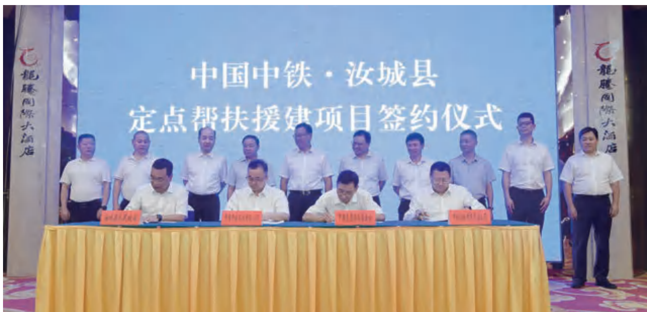
中国中铁与汝城县签订定点帮扶援建项目协议 CREC and Rucheng County signed an agreement on targeted assistance and construction assistance projects

扩大培训覆盖面，提升各类人才能力素质。精准结合帮扶县实际需求，分层次、分类别组织做好各类人员培训工作，扩大培训的覆盖面，全年共培训基层干部406人，乡村振兴带头人123人，专业技术人才1,160人。利用公司党校等培训平台，组织54名帮扶县基层干部参加第二期定点帮扶基层党支部培训班，进一步发挥乡村振兴带头人的“领头雁”作用；在深入组织开展保德县“保德好司机”和汝城县“人人有技能”两个培训品牌项目的同时，打造了“保德好物业”新品牌，帮助首批44名脱贫户家庭成员完成相关技能提升培训，为脱贫户劳动力找到了一条致富新门路。