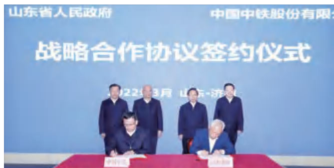
中国中铁与山东省签订战略合作协议 CREC and Shandong Province signed a strategic cooperation agreement

In 2022, the Company fully utilized its advantages in funding, technology, management, and talent to engage in high-level exchanges with local governments and enterprises, including Xinjiang Uygur Autonomous Region, Liaoning Province, Shanxi Province, Shandong Province, Anhui Province, Jiangsu Province, Fujian Province, Chongqing City, Yunnan Province, Guizhou Province, China Export & Credit Insurance Corporation, Sinopharm, China Academy of Building Research, CITIC Group, PICC, State Power Investment Corporation, China Unicom, China Energy Engineering Group, and CIECC. This laid a solid foundation for in-depth cooperation in the future.