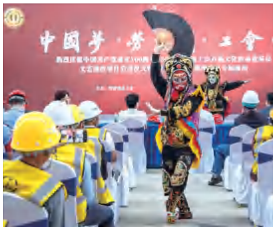
在中国中铁建工郑州航空港站举办的河南省总工会“万场文化活动现场进基层”演出 “Ten Thousand Cultural Activities to the Grassroots” performance held by the Henan Federation of Trade Unions at Zhengzhou Airport Station which China Railway Construction Engineering Group was contracted to build

The Company popularizes the implementation of the employee health care plan, strengthens the construction of the team of internal specialists, guides qualified project departments to actively build employees' mental stations, and sets up exclusive spaces and facilities such as psychological consultation rooms, relaxation rooms, gyms, and physical examination instruments. By relying on psychological consultation, employee assistance