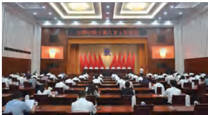
中国中铁召开2022年干部人才工作会议，研究部署人力资源工作战略 CREC held the 2022 cadre and talent work conference on the implementation of human resources work strategy