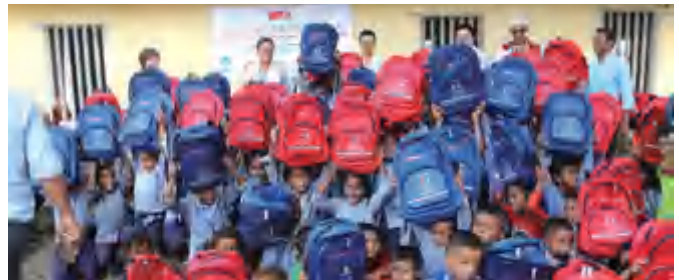
中国中铁二局尼泊尔巴瑞巴贝引水隧道项目联合中国扶贫基金会为当地学校发放爱心书包 Baribabei (巴瑞巴贝) Water Tunnel Project in Nepal in the charge of China Railway No.2 Engineering joined hands with China Foundation for Rural Development to distribute school bags to local schools