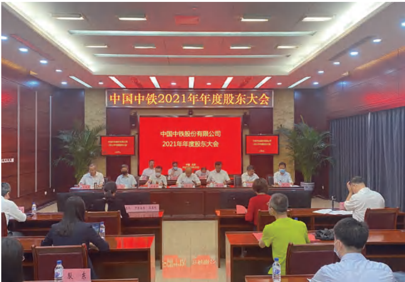
2022年6月22日，中国中铁召开2021年度股东大会，审议通过了年度利润分配方案、董事会工作报告等议案 On 22 June 2022, CREC held its 2021 Annual General Meeting and considered and approved the annual profit distribution plan, the report on the work of the Board and other proposals

profit margin, burden of interest-bearing debts, pressure of accounts receivable and inventory control, exerting an active role in strengthening the Company's finance and risk management. The Remuneration and Assessment Committee of the Board of Directors held 8 meetings and considered 13 proposals, and provided suggestions and opinions thereon, especially the suggestions and opinions on executive performance evaluation plan, and implementation of restricted stock incentives, playing an active role in strengthening the Company's compensation management and performance evaluation. The Nomination Committee of the Board of Directors held 2 meetings and considered 2 proposals, and provided suggestions and opinions thereon, playing an active role in the Company's compliance with laws and procedures for the selection and appointment of directors and senior management. The safety, health and environment committee of the Board of Directors held 3 meetings and considered 4 proposals, and provided suggestions and opinions thereon, playing an active role in strengthening the Company's performance in safety, quality, occupational health and environmental protection.