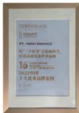
中国中铁被授予“2022中国十大优秀品牌案例” CREC was awarded one of the “2022 China Top Ten Excellent Brands”