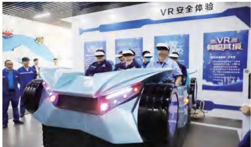
中国中铁在基层广泛开展安全体验活动 CREC extensively carried out safety experience activities at the grassroots level