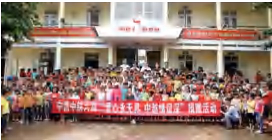
中国中铁六局海外分公司向越南和平省金追小学捐赠学习用品 Overseas Branch of China Railway No.6 Engineering donated school supplies to Jinzhui Primary School (金追小学) in Tinh Hoa Binh, Vietnam

CREC respects local culture and folk customs with a focus on integration with local people, strives to increase local employment, cares for foreign employees, adheres to the cultural concept of “teaching people to fish, serving the world”, and maintains good cultural communication with the host country to widely spread Chinese wisdom and excellent culture.