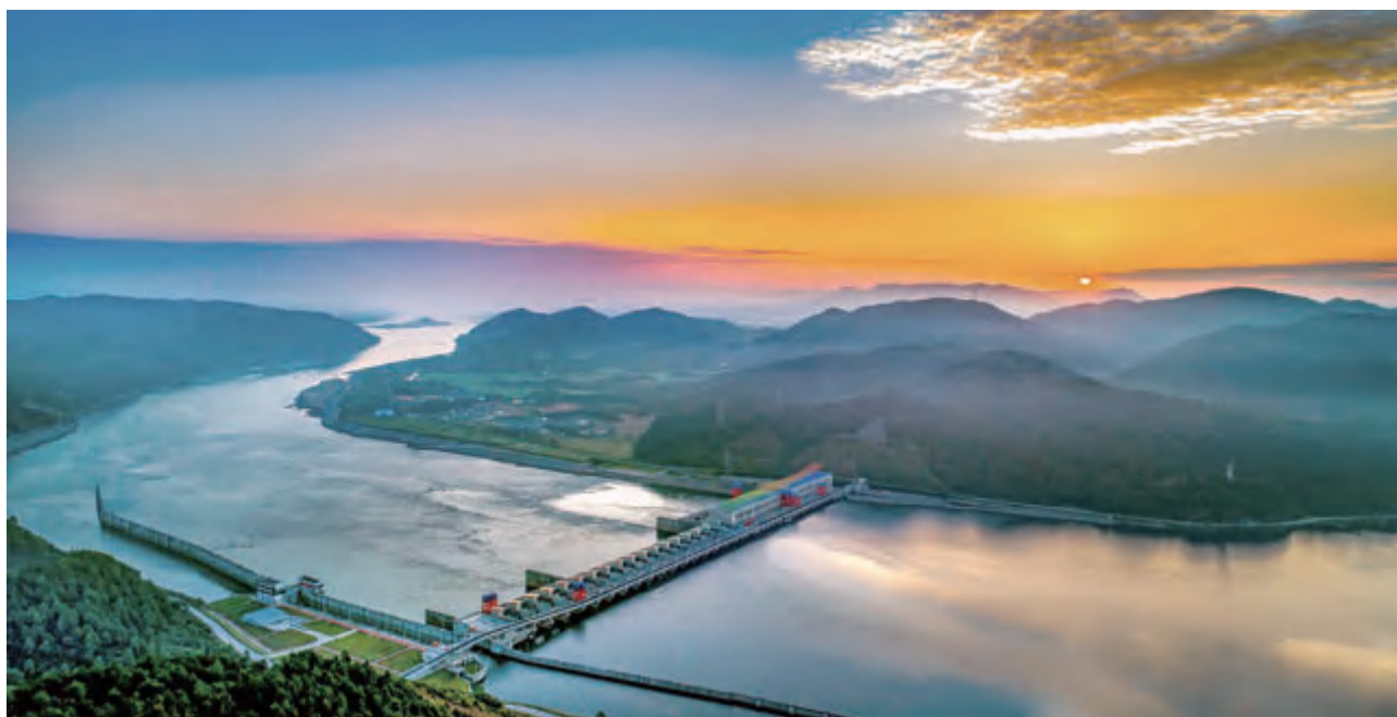
中国中铁在鄱阳湖生态经济区建设的重点水利工程——峡江水利枢纽工程 Xijiang water conservancy hub project - the key water conservancy project built by CREC in Poyang Lake's ecological and economic zone

The Company has participated in the development clean energy, and researched and promoted the use of clean energy technologies such as ground source heat pumps (GSHPs), photovoltaic power generation, combined cooling, heating and power (CCHP), and air energy in construction projects. In the development and operation of construction projects and real estate development, we enable clean energy technologies and resource use platforms to complement each other with their respective strengths. We work to see that the developed construction projects reach advanced levels in the fields of clean energy development and utilization, energy conservation, ecological environmental protection, central heating and cooling, etc.