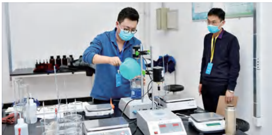
中国中铁举办第四届职业技能竞赛暨第二十届青年职业技能竞赛试验员大赛 The 4th vocational skills competition and the 20th youth vocational skills competition for testers held by CREC

In 2022, the Company selected and recommended 1 candidate for the Grand Skill Award of China, and 2 candidates for the National Technical Expert award. Enterprises at all levels actively select and recommend outstanding employees to provide a promotion pathway for the best employees. These awards demonstrate the elegant demeanour of CREC's excellent skilled personnel and carry forward the labor spirit and craftsman spirit of the employees.