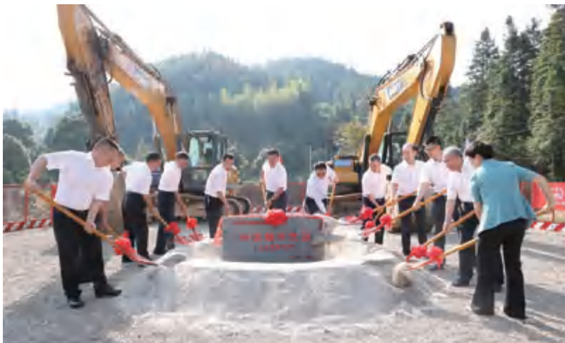
中国中铁在湖南省桂东县捐建的中铁振兴大道正式开工 The CREC Revitalization Avenue in Guidong County, Hunan Province donated by China Railway was officially commenced

In 2022, CREC selected 6 cadres assuming temporary posts, invested RMB84.63 million in targeted assistance funds (including RMB64.4 million of donation and RMB20.23 million of reimbursable funds), attracted RMB573 million of assistance funds (including RMB258 million of donation and RMB315 million of reimbursable funds), trained 406 grass-roots cadres, 123 rural revitalization leaders, and 1,160 professional and technical personnel. The Company purchased RMB22.482 million of agricultural products and helped sell RMB2.208 million of agricultural products. The Sweet “Home” (《幸福“窝”》), a short video themed great changes in village Tuanwo, Baode County, was nominated for the “Villagers’ Story about Prosperity (听老乡说小康)” award. Dongshan Village, Rucheng County was honored with the title “Beautiful Demonstration Village in Hunan Province”. Reshui Village attracted investments of RMB40 million from private enterprises to develop hot spring inns. Rucheng County’s “four determinations and six supports (四出六靠)” habitat improvement model fully aroused the enthusiasm of local people for engagement and magnified the effectiveness of investment funds, which was highly recognized by the National Rural Revitalization Administration during the field inspection. The educational book “Red Rucheng (《红色汝城》)” and the children’s song “The Warmth of Half a Quilt (《半条被子的温暖》)” were rated by Chenzhou among the excellent works for “Five-Ones Program (五个一工程)” in Chenzhou.