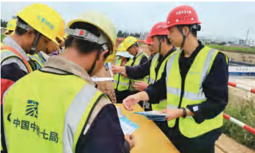
中国中铁七局武汉公司开展安全生产月咨询日活动 Wuhan Branch of China Railway No.7 Engineering Group Co., Ltd. carried out consultation day activities for the month of safety production

The Company continuously improves the education and training system for project safety, continuously promotes the application of safety education training micro-classes, prepares and supplements the courseware on the prevention of common quality problems, and uses multimedia safety training toolbox to train field operators to realize the fun, informatization, systematization and standardization as well as diversification and specialization of training. In 2022, the Company conducted examinations for all employees to understand the Production Safety Law 《安全生产法》 and the production safety management policy, and sent employees to supervise the examinations on site in the affiliated enterprises. The Company organized continuing education for registered safety engineers and “three types of personnel”, and trained more than 3,300 full-time personnel. Using online and offline methods, the Company trained a total of 342,000 times for enterprise leaders, project managers, safety and quality personnel and operators at all levels, further improving the quality of the full-time team and employees.