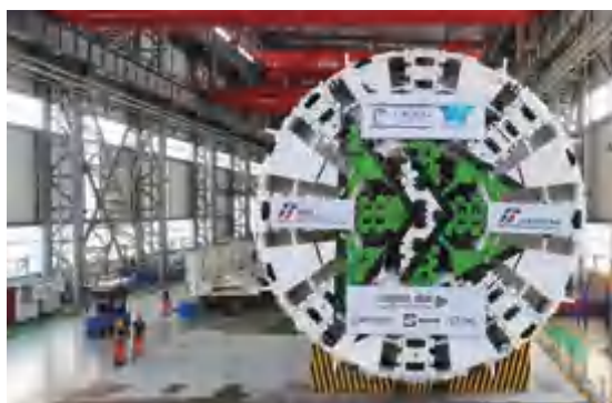
中国首台出口欧盟本土的盾构机——应用于意大利CEPAV 铁路项目的“中国中铁699号” “CREC No. 699” used in the CEPAV railroad project in Italy – China’s first shield machine exported to the European Union

On 10 May 2014, when General Secretary Xi Jinping inspected China Railway Engineering Equipment Group Co., Ltd. (CREG), he proposed to “promote the transformations from being ‘Made in China’ to being ‘Created in China’, from China’s Speed to China’s Quality, and from Chinese Products to Chinese Brands.” The Chinese Brand Day on 10 May was thus born. For the past nine years, we have always kept in mind and carefully implemented General Secretary Xi Jinping’s important instructions of “Three Transformations”.