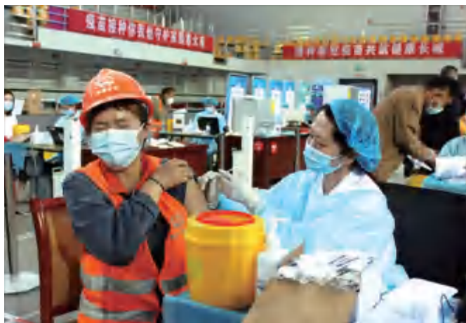
中国中铁关爱务工人员健康，广泛接种新冠疫苗 CREC cared for the health of labor workers and ensured that they were vaccinated with COVID-19 vaccines