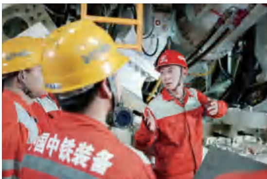
中国中铁拥有一支数量适中、结构合理的人才队伍 CREC has a talent team with adequate members and a reasonable structure

The Company intensifies efforts to introduce the graduates of "Double First-rate" universities. In light of the business characteristics and development needs, the Company introduced 4,406 graduates from "Double First-rate" universities in 2022, accounting for 20.5% of the total, up 1.9 percentage points year on year.