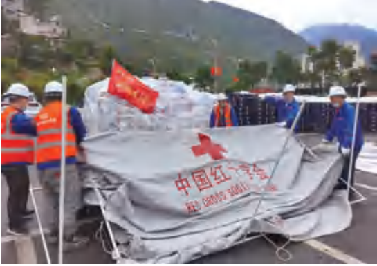
中国中铁大桥局大渡河大桥项目正在参与四川泸定地震抗险救 Dadu River Bridge of China Railway Major Bridge Engineering Group Co., Ltd. was participating in the Sichuan Luding earthquake rescue